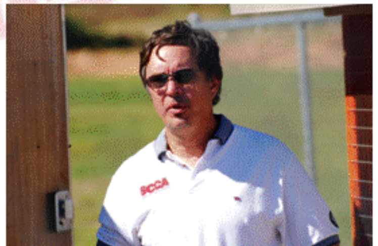
Topper thinking of more ways to use the word "Pucker"