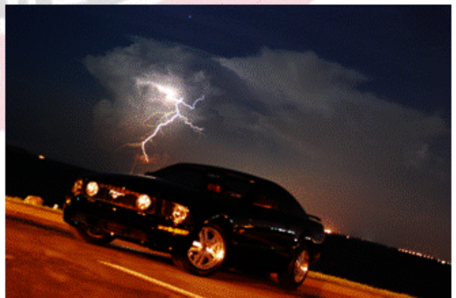
My car getting hit by lightning.